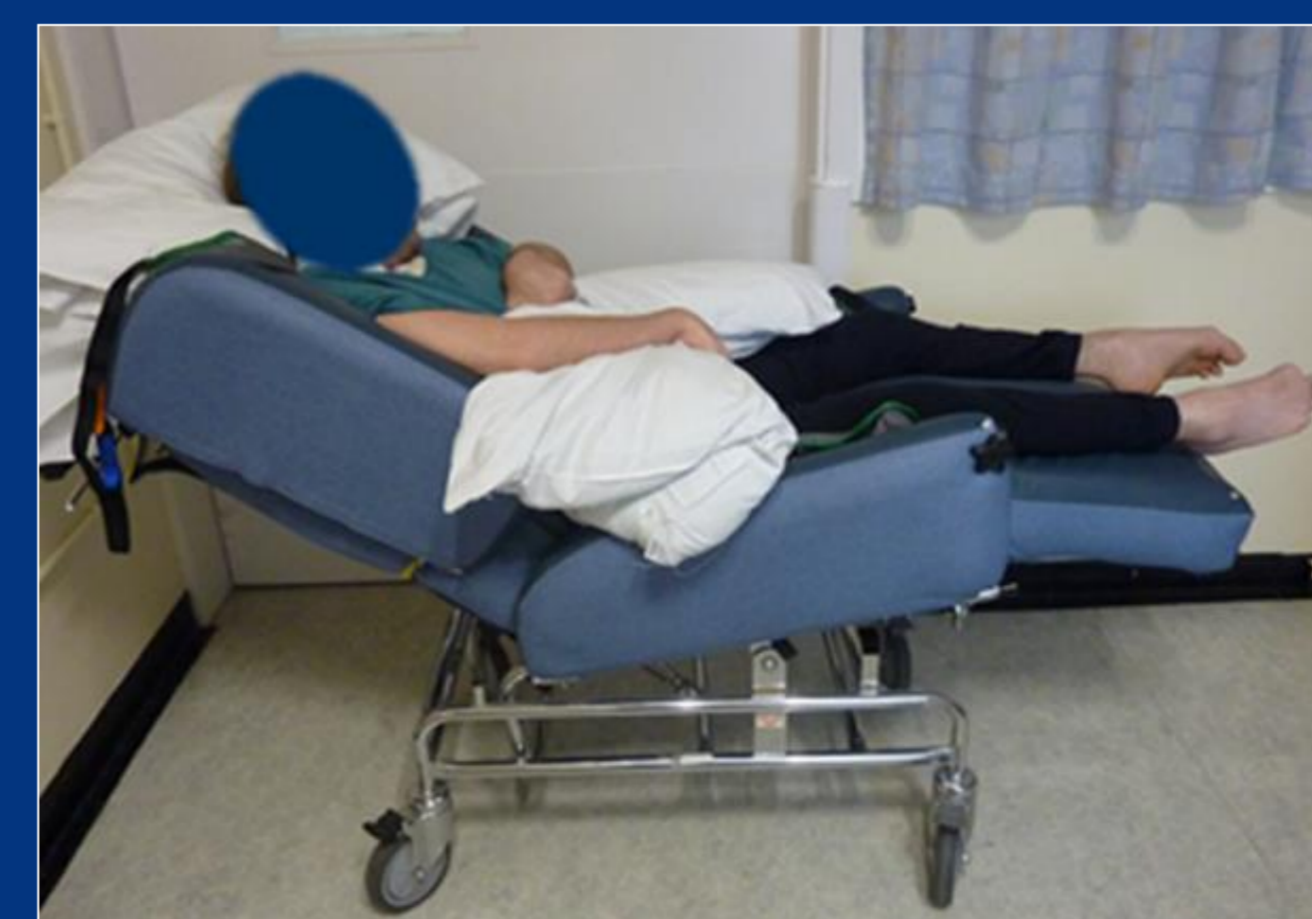
Fig. 5.1: On admission