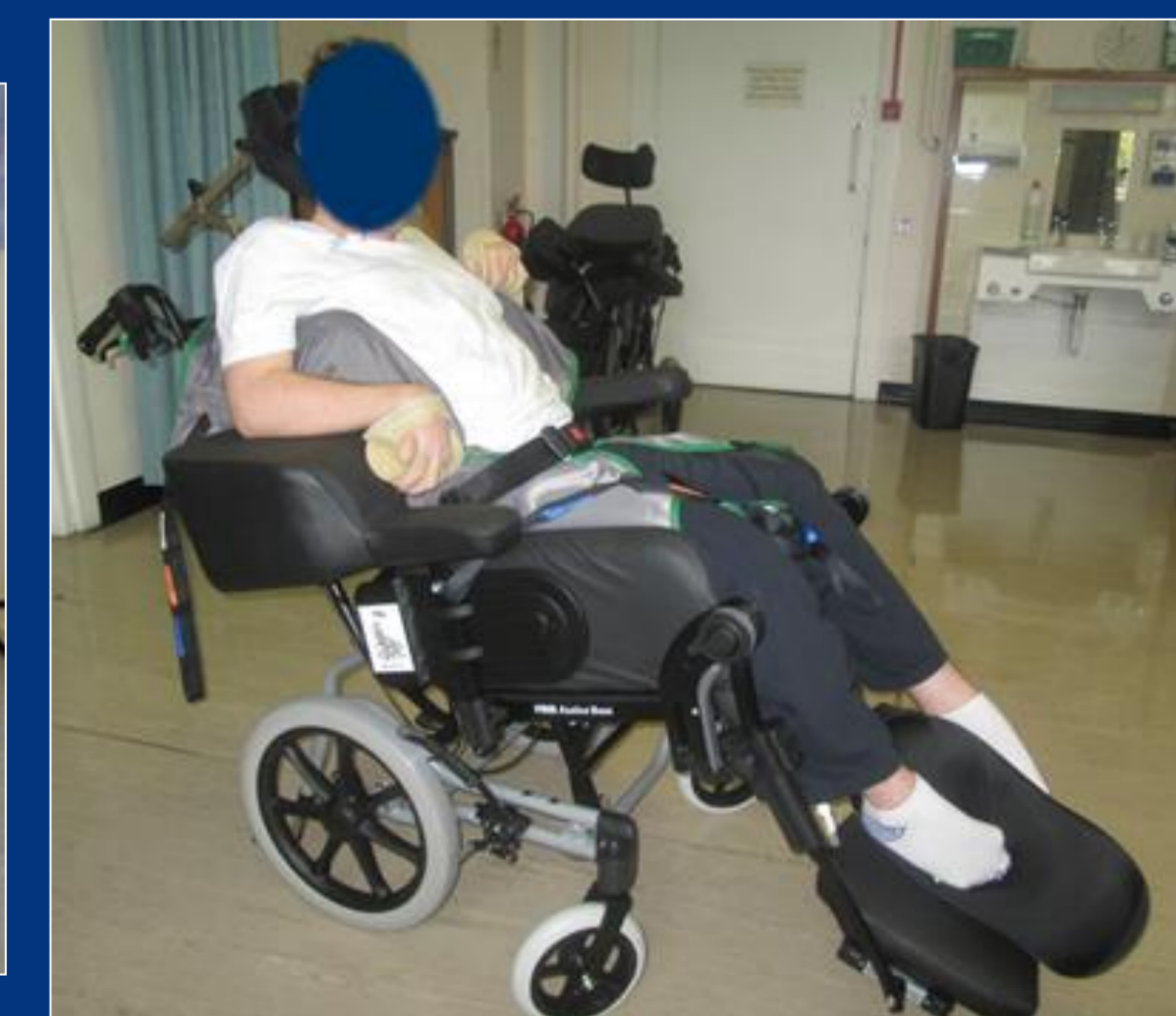
Fig. 5.2: Provision of Customised wheelchair