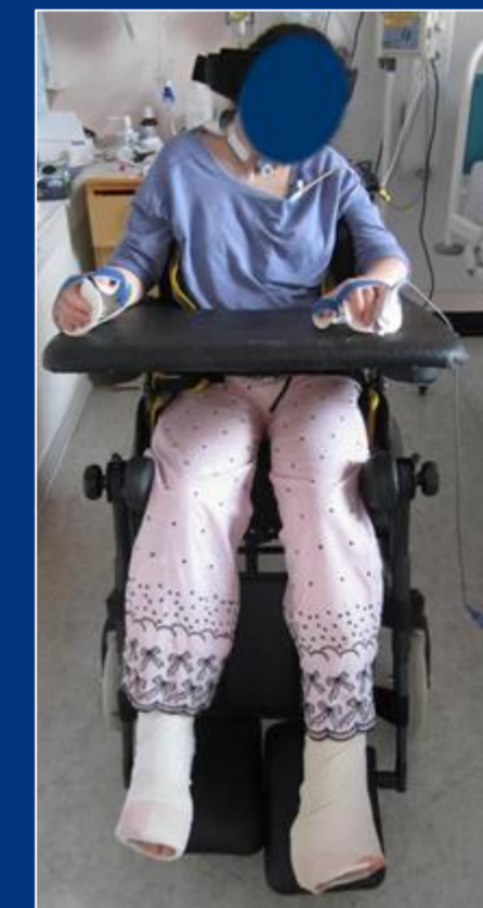
Fig. 2.1: On Admission