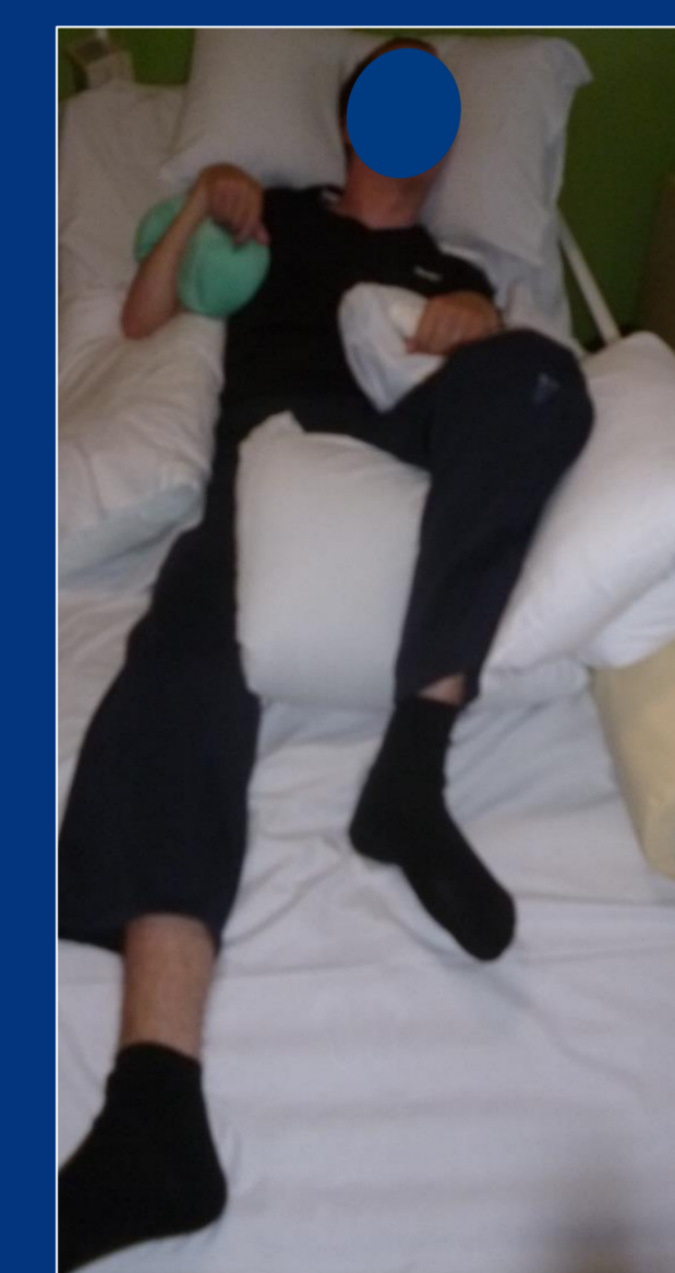
Fig. 4.1: On admission