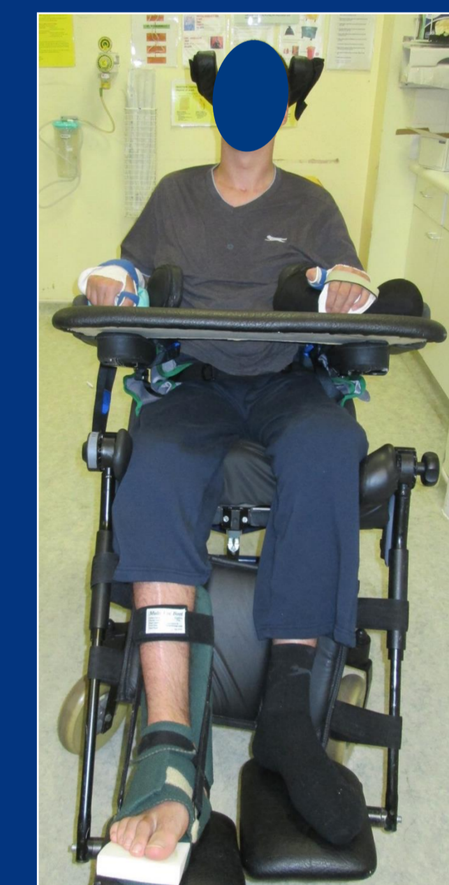
Fig. 4.2: Provision of Customised wheelchair