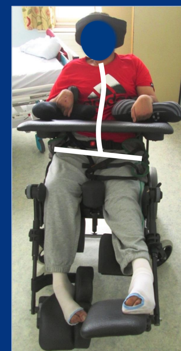
Fig. 3.1: On admission