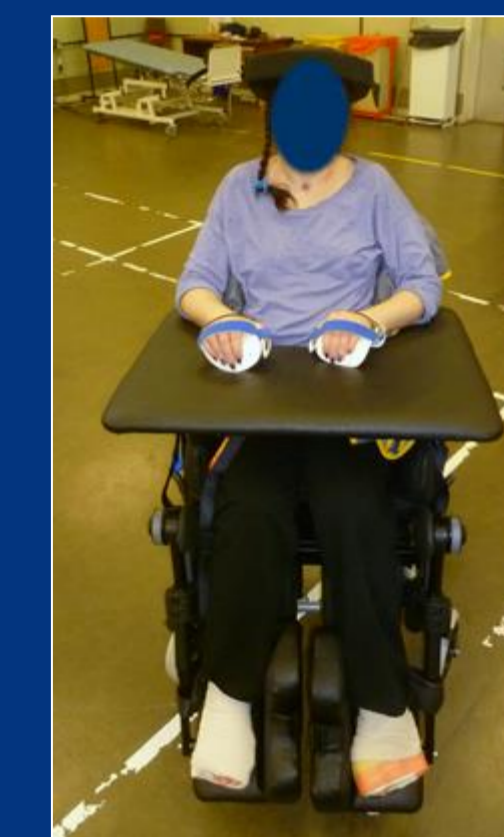
Fig. 2.2: Results